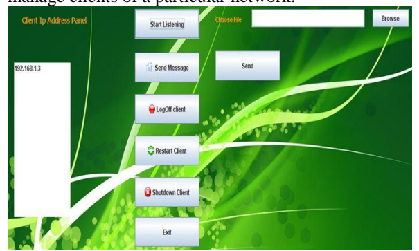
Fig 2: Server side interface

The server side was successfully deployed on the cloud from where it was used to monitor and manage clients of a particular network.