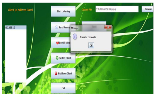
Fig 3: Successful file transfer operation

Successful operations were carried out using the server interface with very minute or almost no delays and the remote clients functioned properly.